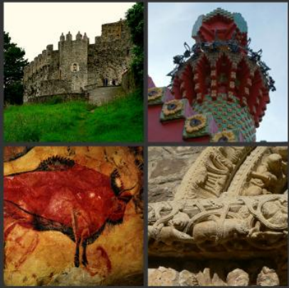
Historic sites spanning millennia 40,000 B.P. to medieval to modern

Northern Exposure Spain is about enjoying the things you love, taking pleasure in new experiences, and discovering a place you haven't heard of but won't soon forget.