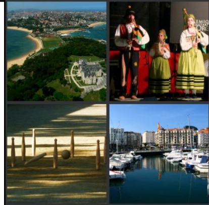
The vibrant seaside capital Santander and unique cultural traditions

Northern Exposure Spain is about enjoying the things you love, taking pleasure in new experiences, and discovering a place you haven't heard of but won't soon forget.