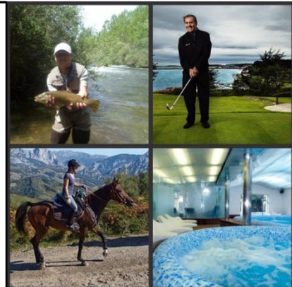
Learn Spanish, fly fish, golf, outdoor sports and spas